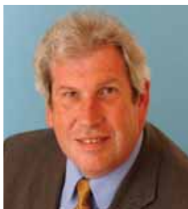
Malcolm Wicks MP Minister for Energy

A handwritten signature in black ink that reads "Elliot Morley". The signature is written in a cursive style.